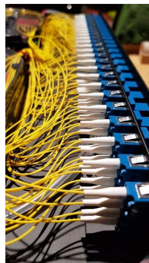
Full patch panel