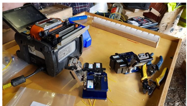
Splicer and cleavers at the ready

The new arrivals at Silent Pool, Mandira's Kitchen (formerly Surrey Spice) are connected but if anyone else would now like to take service in our live areas, please let us know.